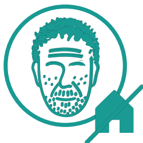
Individual Experiencing Homelessness