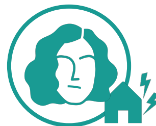
Individual At Risk of Homelessness