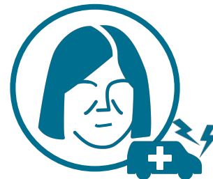
Individual At Risk of Psychiatric Facility or Urgent/Crisis Services Utilization