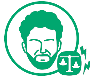
Individual At Risk of Justice Involvement